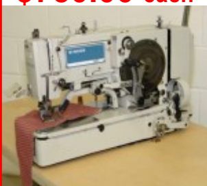
Singer Model 371 Lockstitch, Button Hole $995.00