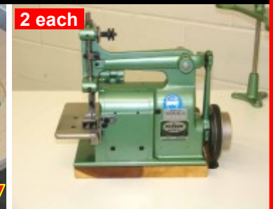
2 each Merrow Model 18E Blanket Stitch Serger $2,650.00 each