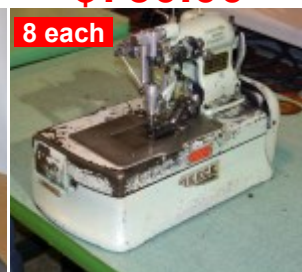
8 each Reece Model S-2 Button Hole/Tacker $295.00 each