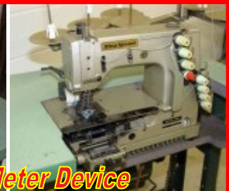
King Special DTN-45 4 Needle Chain Stitch $450.00