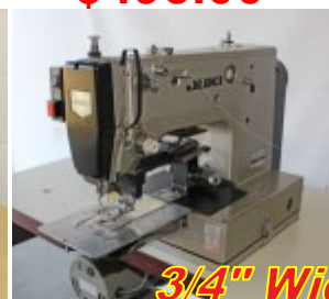
Juki AMS-206A Circle Tack Machine $375.00