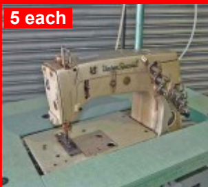
5 each U.S. Model 56000 2 Needle Chain Stitch $750.00 each