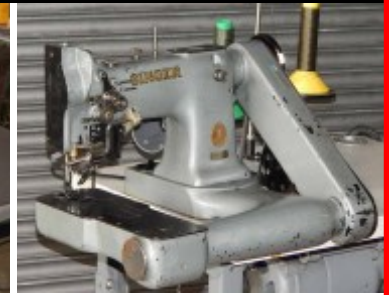
Singer Model 134 2 Needle Lockstitch Use to Sew Stripes on Pants $1,250.00