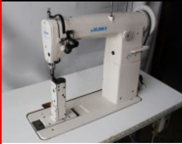
Juki Model PLH-981 Single Needle, Needle Feed Post Machine, Lock Stitch $1,850.00