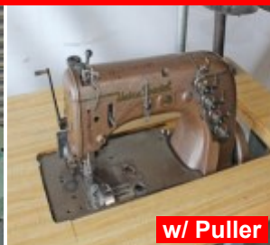
U.S. Model 51400 2 Needle Chain Stitch $495.00