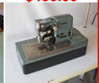
Juki Model MH-180 Button Hole Machine $645.00

***SALE SPECIAL...SAVE NOW!!!***SALE SPECIAL...SAVE NOW!!!***SALE SPECIAL...SAVE NOW!!!***SALE SPECIAL...SAVE NOW!!!***