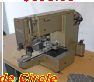
Mitsubishi PLK-03BTA Circle Tack Machine $375.00