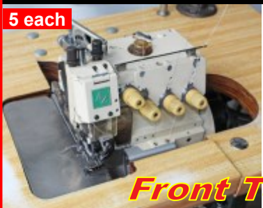
5 each Yamato Model AZF-8500 5 Thread Top Feed $1,150.00 each