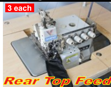
3 each Brother Model MA4-V92 5 Thread Top Feed $925.00 each