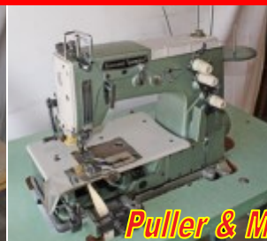
K.S. Model DVK-1720 Cover Stitch, w/Puller $750.00