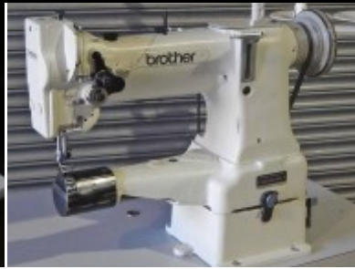
Brother Model LS3-C53-050 , Single Needle Cylinder Walking Foot $1,150.00