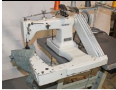
Brother Model DT6-B926 3 Needle Chain Stitch Heavy Duty for Pants or Jeans $1,750.00