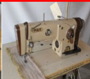
PFAFF Model 438 3 Step Zig Zag $695.00