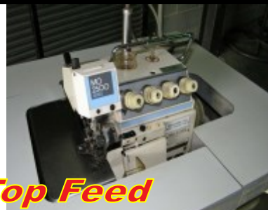
Juki Model MOR-2516 5 Thread Top Feed $1,250.00